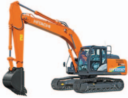
2 ZH200-6 hybrid hydraulic excavator