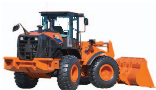
5 ZW150-6 wheeled loader