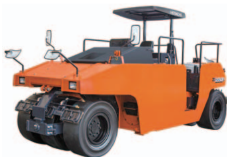
7 ZC220P-6 pneumatic tired roller

While the operator is driving the dump truck, a millimeter wave radar mounted to the front is used to detect any obstacles in front of the vehicle. Based on the distance and relative angle