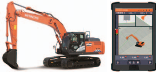
1 ZX210X-6 ICT hydraulic excavator (left) and touch panel monitor (right)