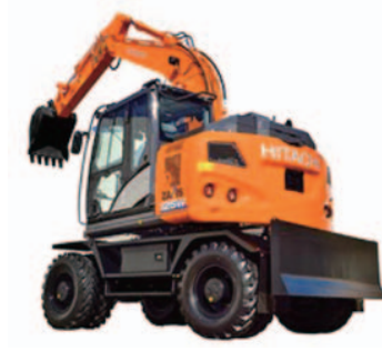
3 ZX125W-6 wheeled hydraulic excavator